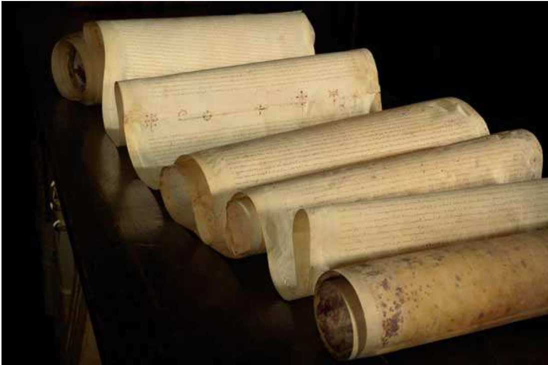
"Rubricae" of the Council Fathers.

In this context, at the end of October 1311 seven Templars presented themselves in the cathedral of Vienna, offering to defend the Order and saying that there were from 1,500 to 2,000 brothers ready to support them around the city.