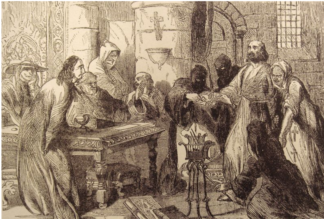
Examination of the Jacques de Molay

Datum Vienna, XI calendas aprilis, pontificatus nostri anno septimo.