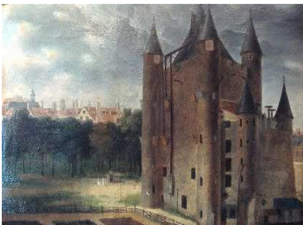
The Temple of Paris

The Latin text of the bull, that is reported here, is taken from " Conciliarum Oecumenicorum Decreta " 8 . Given that the wording of the text is similar to that used for the preparation of administrative acts or verbal questioning of witnesses (which tends to leave little room for the elegance of the literary form), the English translation, that is proposed in the translation of the bubble, is not perfectly literal: in fact, it would result a little understandable text to the modern reader. In the translation of the bubble, we intended to give preference to the inherent sense of the content of the document itself, reported - as far as possible - in a consistent manner with the language and the modern forms of exposition.