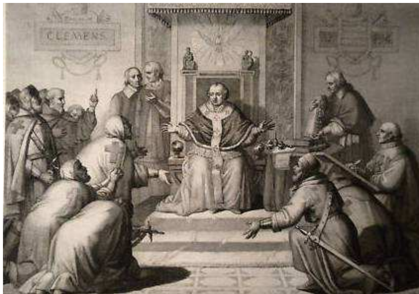
Jacques de Molay at the audience with Clemente V before the arrest

According to the pope the council was to be ecumenical and therefore injunctions were sent to participate to 161 prelates, their suffrages and to the clergy of the Papal Court. The other prelates, if they wanted to, they could participate or to send their delegates. The kings of France, England, Portugal, of the Spanish kingdoms of Sicily, Hungary, Bohemia, Cyprus and Scandinavia were also invited. In fact, 20 cardinals, 4 patriarchs, about 100 between bishops and archbishops and some abbots and priors were present at the council. More than a third of the prelates did not appear in person, an attorney represented them; and 114 did not answer to the meeting. No ruler intervened in the council, except the king of France and his son Louis, King of Navarre, that attended the reading of the bull " Vox in excelso " on 3 th April 1312.