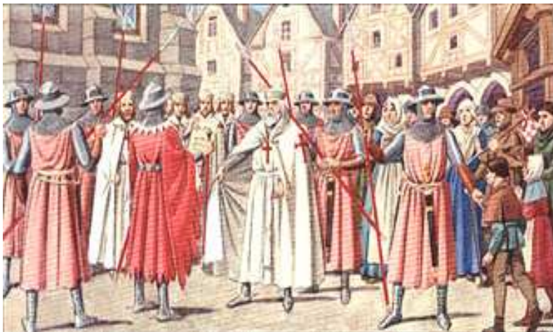
The arrest of Jacques de Molay

The affair of the dissolution of the Order of the Temple was at the centre of negotiations between Pope Clement V and King Philip IV of France, which, from 26 th May to 24 th June 1308, lived in Poitiers, the temporary See of the Papal Court, to induce the Pope to abolish the Order of the Temple.