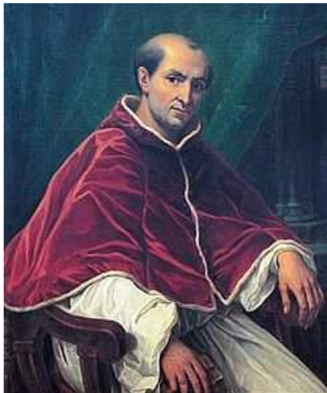
Pope Clement V