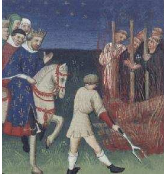
Philip IV assists the burning of the Templars