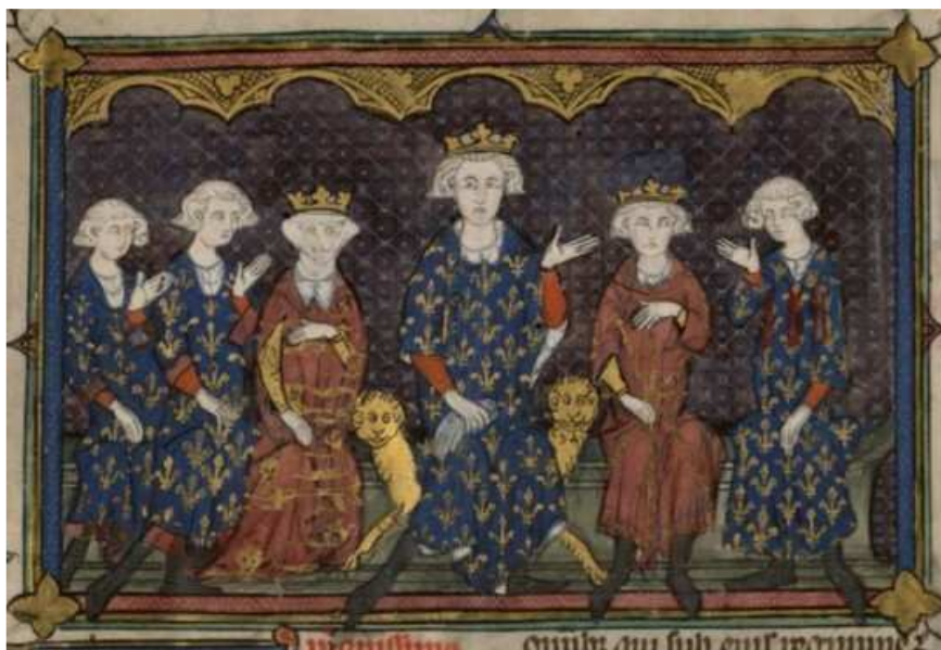
Philip IV by side with his sons and brothers

But Clement V continued to be uncertain about the decisions to be taken in order to obtain recognition of the right to defence to the Templars, to establish a new Order to which transfer the Templars' goods, to transfer the goods to the Order of the Hospitallers Knights Templar to be used for a new crusade and to recognition the instances of the Iberian Peninsula rulers, who demanded the transfer of the Templars' goods, falling within their territories, to their respective crowns, or to the Orders connected to them.